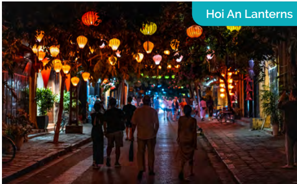
Hoi An Lanterns