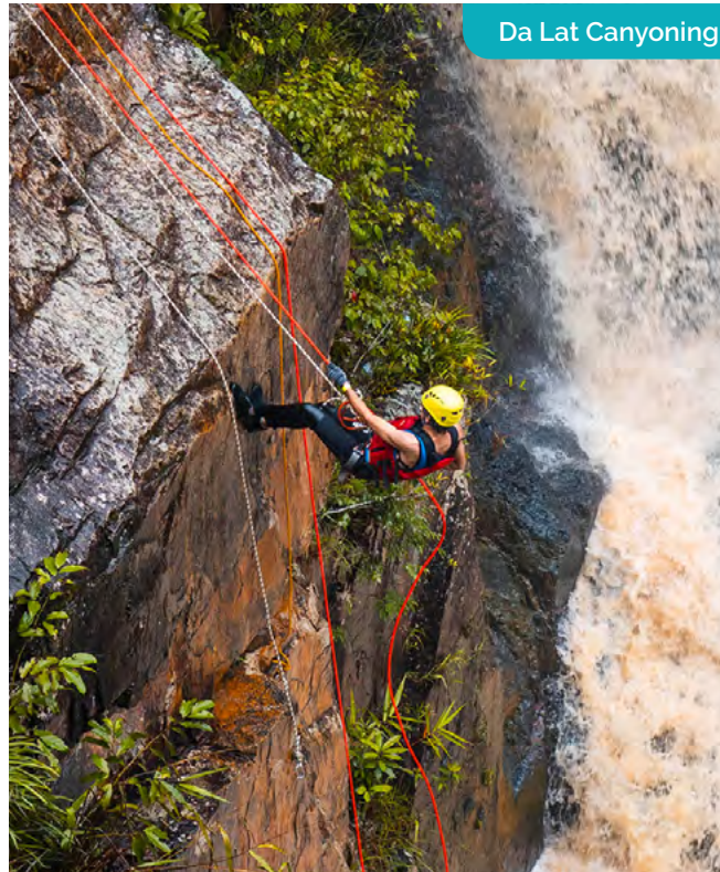
Da Lat Canyoning