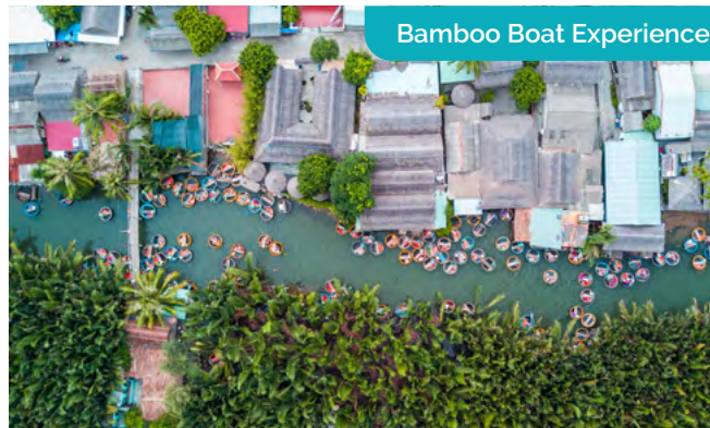
Bamboo Boat Experience