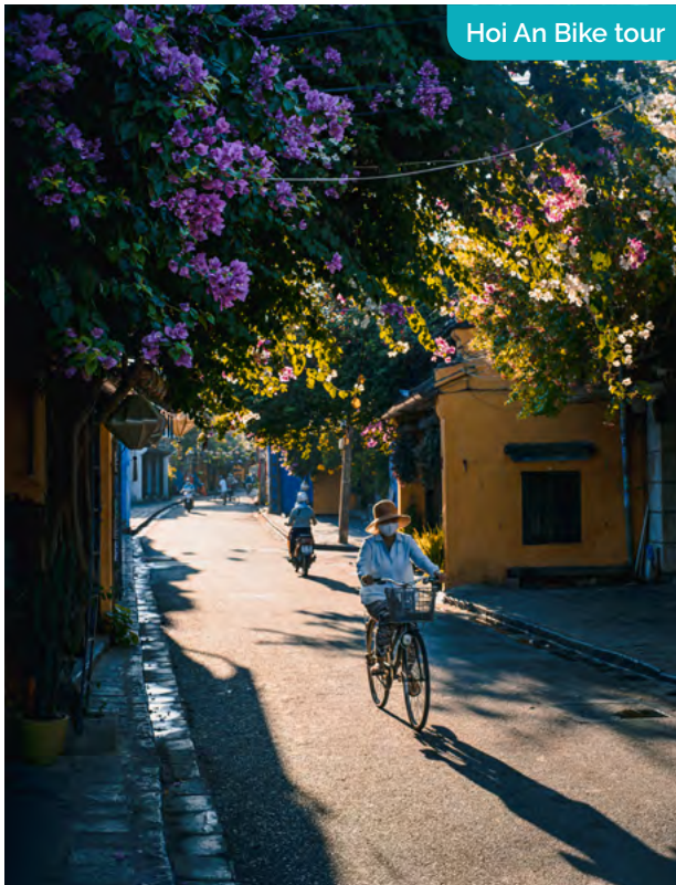
Hoi An Bike tour